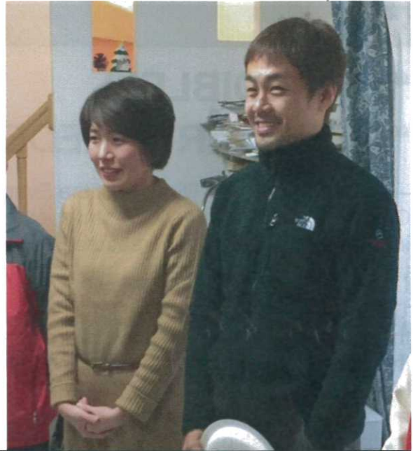
Our new neighbors and first person to say "yes" to Jesus in our neighborhood!